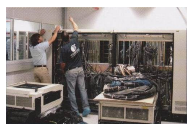
Figure 2: T5365 installation and set up at Qimonda.

Tester set up is illustrated in figure 2 and was concluded during the summer, being available for the students by September 2007.