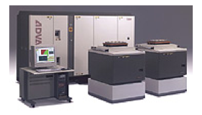
Figure 1 : A typical automatic production test station for modern SDRAM devices.

training program, which in the case of Qimonda Portugal might reach up to half-a-year. In-house, the engineers establish remote access to the engineering and production test equipment – test development and product analysis is done from the engineering offices, but the testers are located in the factory floor. Technically speaking, there is no difficulty to access an automatic test station remotely. The trend to offer remote access to laboratory workbenches is wide-spreading rapidly in universities worldwide, and many research projects have addressed the development of remote labs and virtual labs in the last decade<sup>1</sup>.