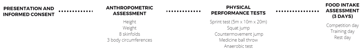
Fig.1 - Research methodology scheme.

A methodology scheme of this study is presented in Fig. 1.