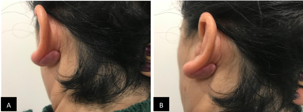
Fig. 1 (A and B) Idiopathic posterior left ear keloid before treatment.