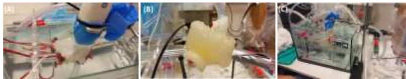
Figure 3 - Experimental validation scenario.

In this study, a novel interventional framework for TSP is described. It uses the potentialities of the intra-procedural volumetric US image to create an integrated interventional scenario where both pre-planning, intra-procedural data, and surgical