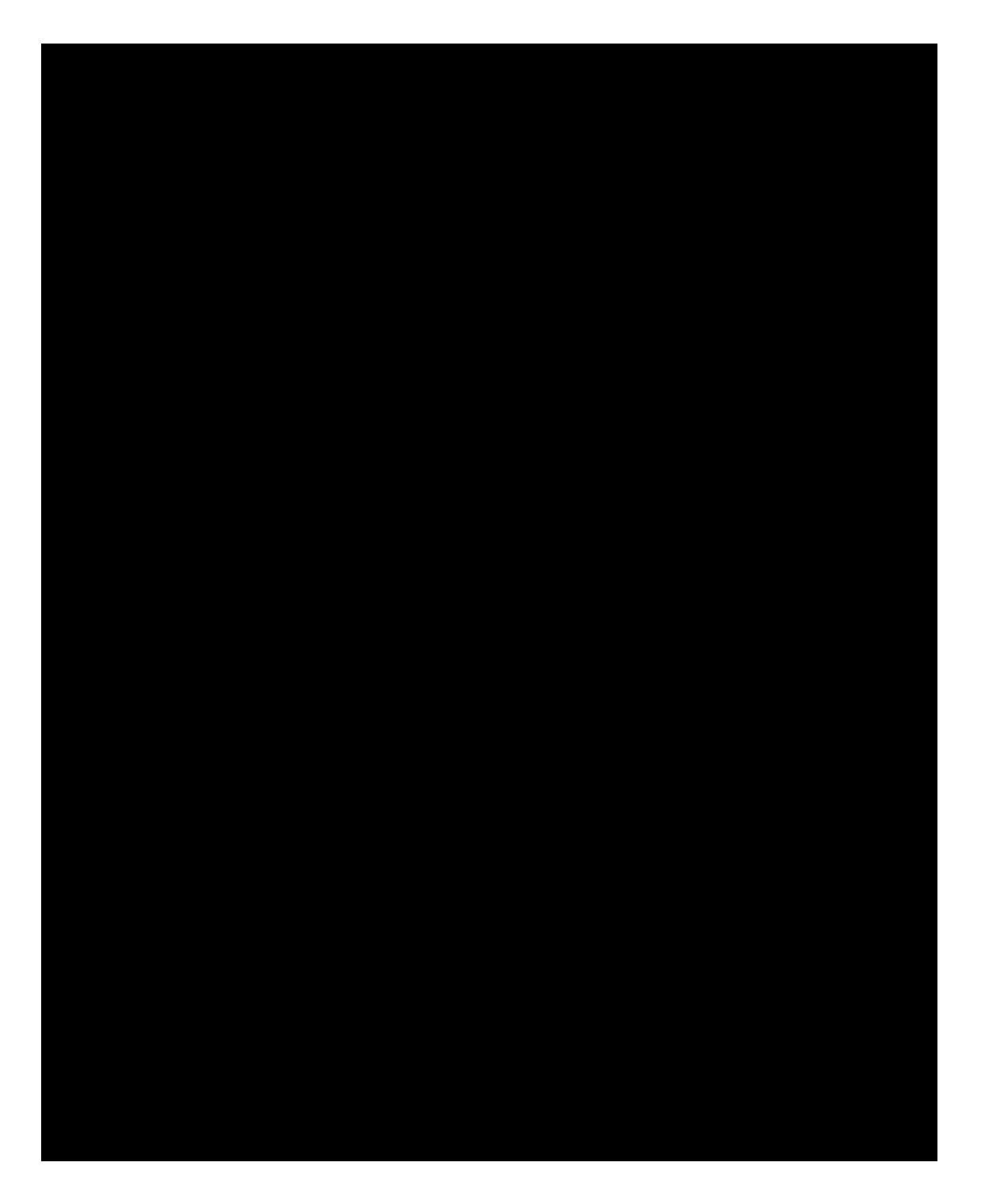
Fig. 3 DSC profile of HCW components: ( solid lines ) original, ( dashed lines ) hydrolysed and ( dotted lines ) autoclaved. The DSC profiles of untreated and hydrolysed bag collector for urine coincide with DSC profiles of examination glove