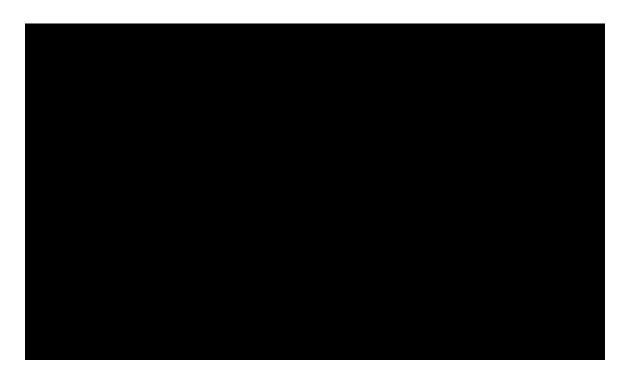
Fig. 1 Diagram of the alkaline hydrolysis process